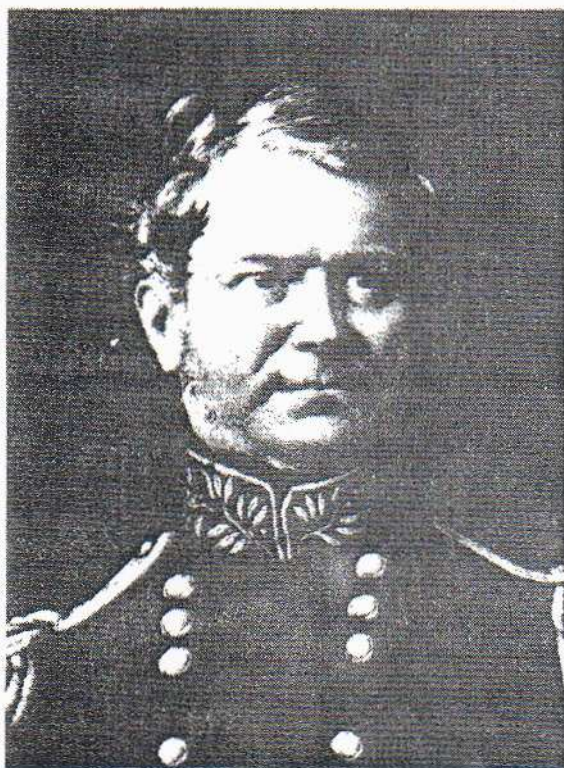
Fig. 1: William Jenkins Worth, from an engraving by John Sartain.

One of America's great military figures, William Jenkins Worth (Figure 1), was born to Quaker parents in Hudson, New York, on March 1, 1794.